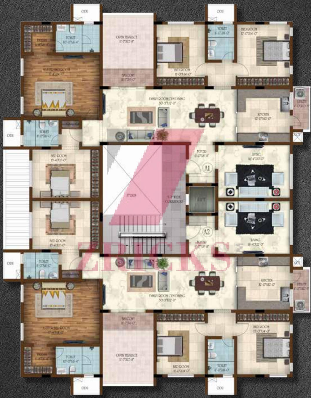
Typical Floor First Floor Plan