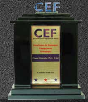
'Excellence in Customer Engagement', 2013, by CEF