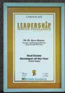
'Real Estate Developer of the Year', 2013 by Brand Academy