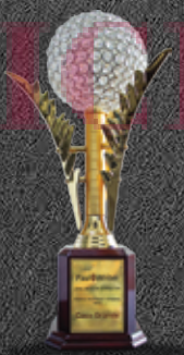
'Creative Real Estate Company', 2013 by Paul Writer Magazine