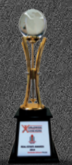
Casa Grande Arena, Most Admired Project in Southern Region 2014 by Worldwide Achievers