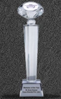
'Marketer of the Year', 2013 by Realty Plus Magazine