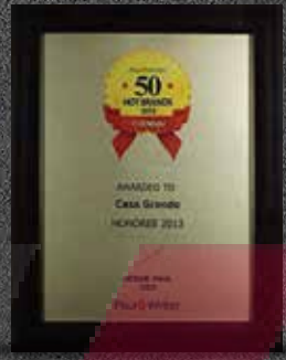
'Top 50 Brands in Chennai', 2013 by Paul Writer Magazine