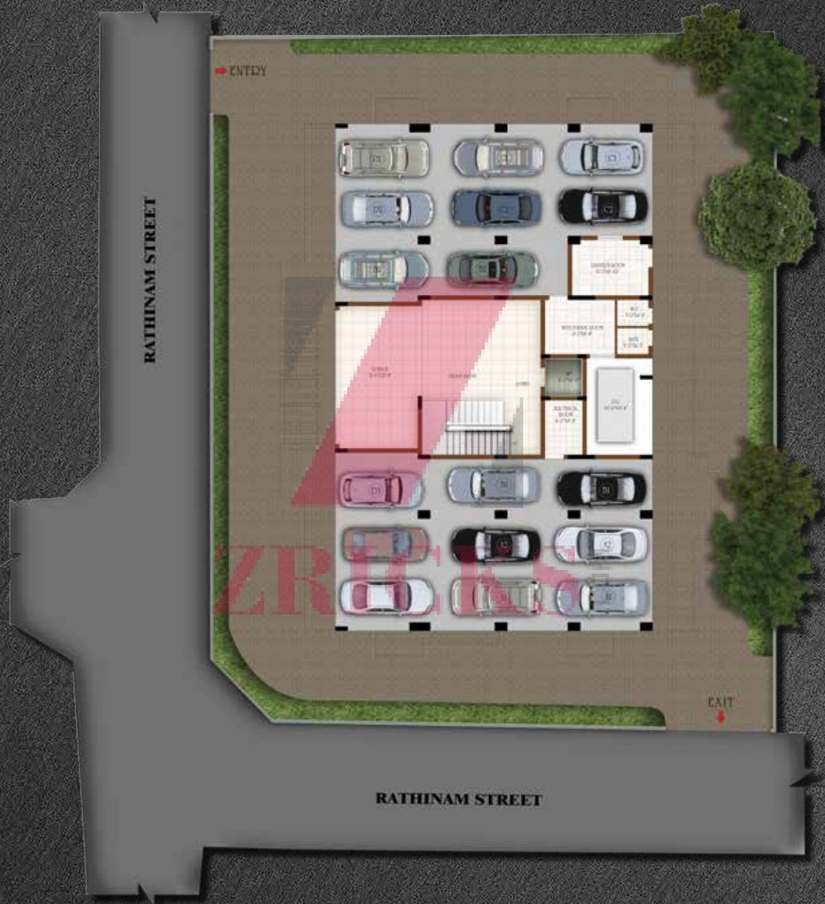
Site Cum Stilt Floor Plan